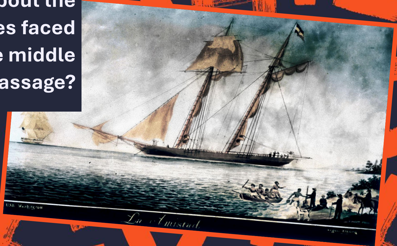
La Amistad, 1839

What can different types of sources tell us about the conditions and experiences faced by the captives during the middle passage?