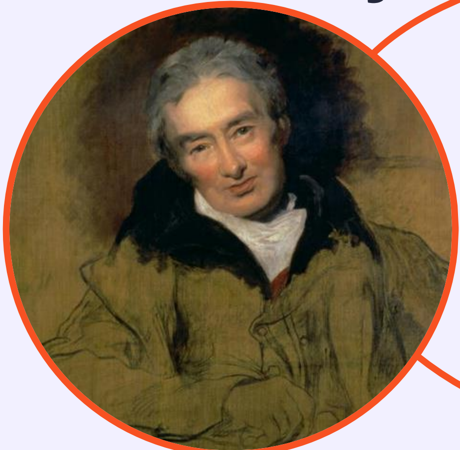
Sir Thomas Lawrence, Unfinished portrait, 1828

A trade founded in iniquity, and carried on as this was, must be abolished, let the policy be what it might,—let the consequences be what they would, I from this time determined that I would never rest till I had effected its abolition.