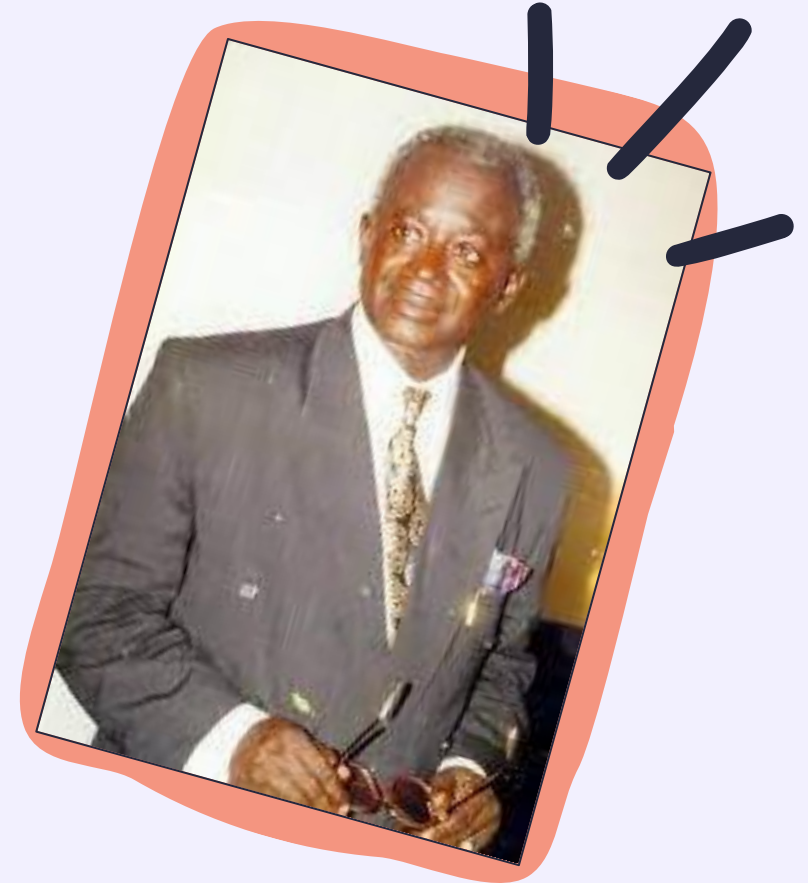
Professor Albert Adu Boahen

“Since the slave trade.. was a monopoly of the Kings and their military leaders and advisers, the bulk of the income went to them”